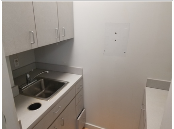
Small sink area